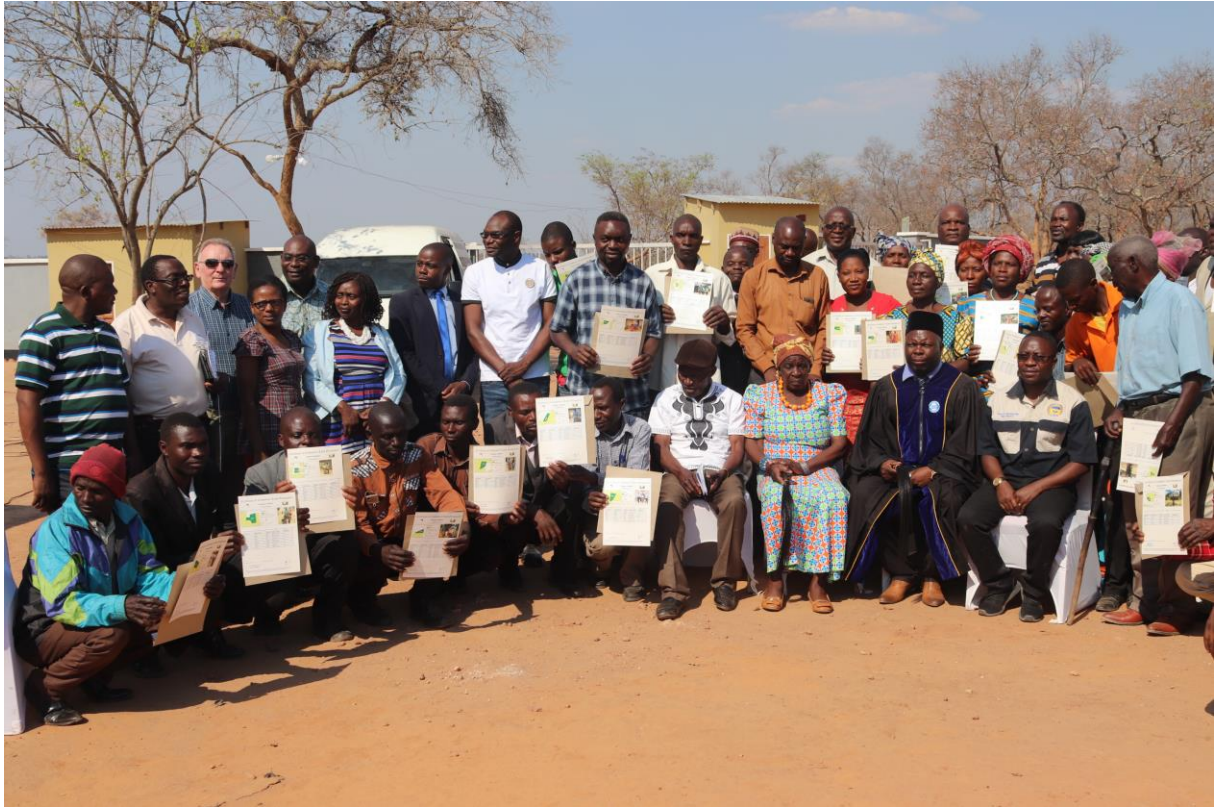
Photo 3: Beneficiaries of customary land certificates during the handover ceremony in September 2018

support industries such as transport, hospitality, housing, health and other services that will result to more economic activities and employment opportunities for the local communities.