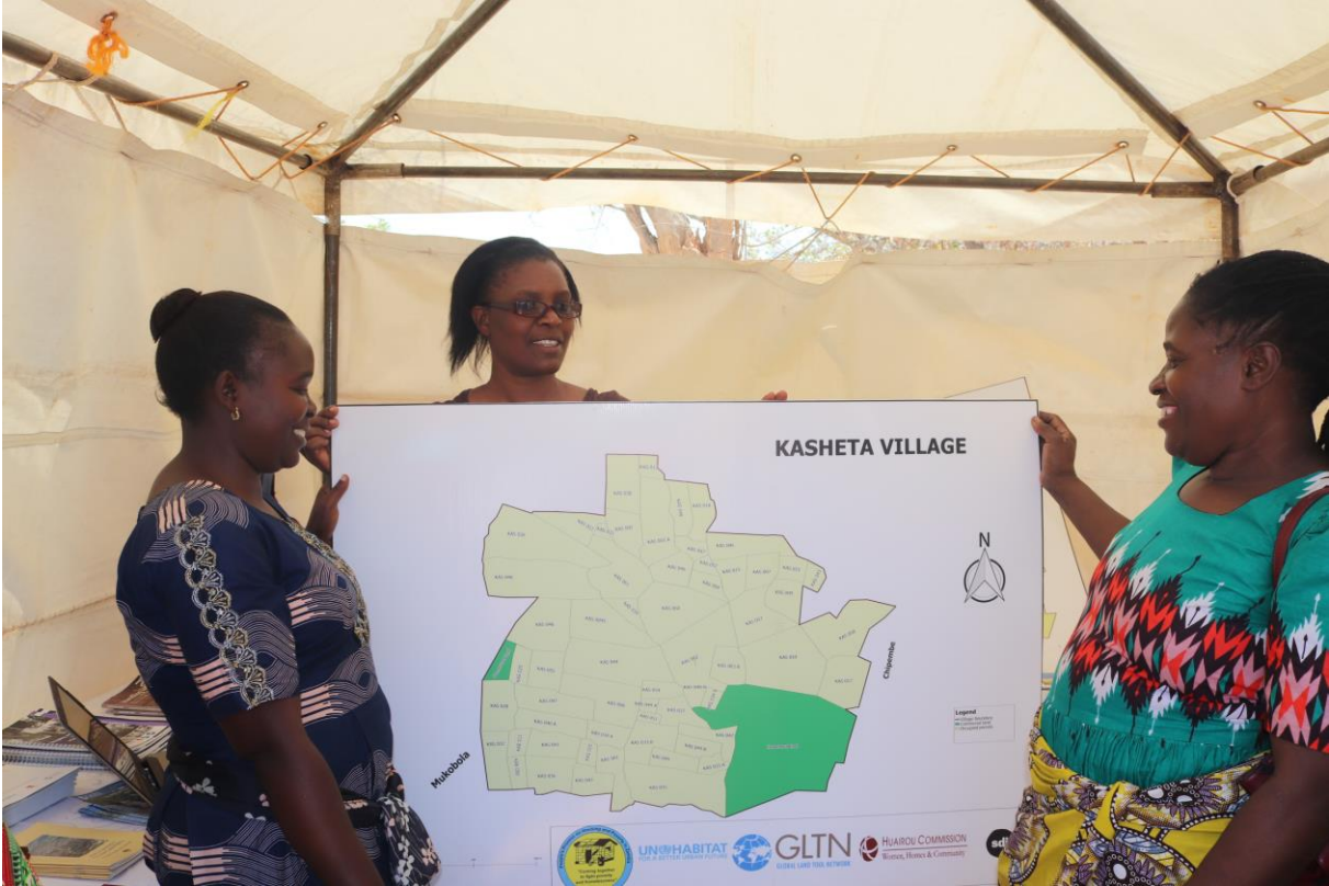
Photo 1: Community members display one of the maps drawn from the data collection in Chamuka Chiefdom

All the eleven villages were profiled, enumerated and mapped by the STDM steering committee. A total of 538 land parcels were surveyed and mapped across the 11 villages. Further, a total of 561 households were enumerated with a total population of 3,102. In terms of gender disaggregation, a total of 1,612 females or 52% of the population were captured, and approximately 1,490 or 48% males. From the project area, a total of 191 were female-headed households. In terms of land ownership, 286 of the 538 parcels surveyed are owned by men whereas females own approximately 97 parcels. About 155 parcels are jointly owned in the 11 villages.