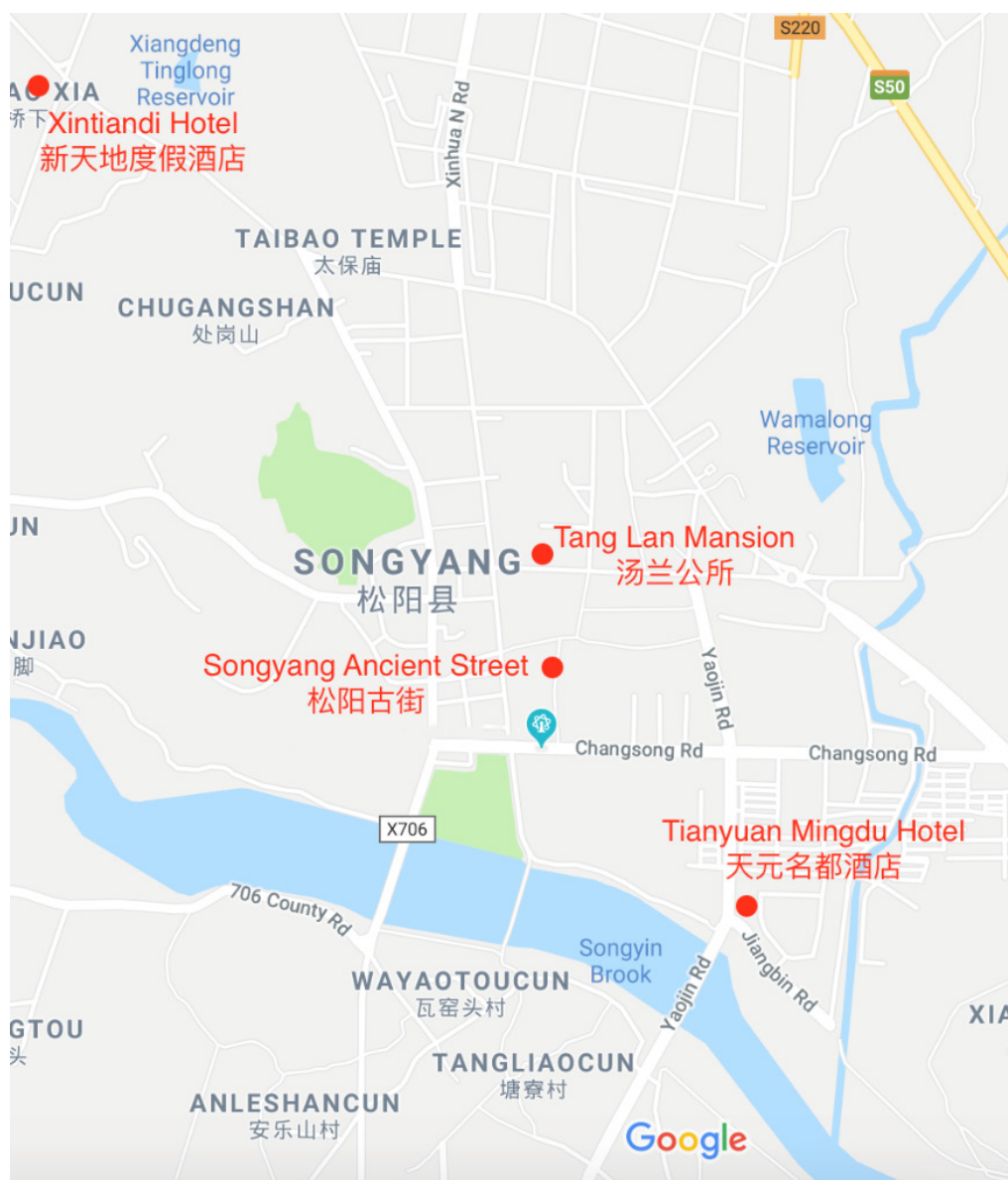
Venue, hotels and key spots of the Forum.

(PS. The distance between Tianyuan Mingdu Hotel and Tanglan Mansion is about 1.5 km, and the distance between Xintiandi Hotel and Tanglan Mansion is about 2.5 km. We will prepare pick-up service for participants during the forum.)