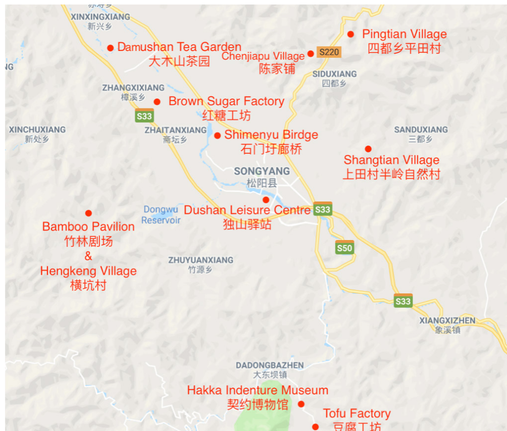
Field trip locations

There will be one native Songyang County official introducing the field trip sites. All participants will visit Route 1. Then participants choose one of the routes during the same time and attend the parallel events they are interested in.