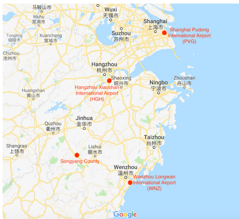
The location of the airports.

Songyang will provide all participants with airport pick-up service (it is recommended that participants take the flights to Shanghai Pudong International Airport which is about 6 hours' drive (500 km) to Songyang, Hangzhou Xiaoshan International Airport which is about 3.5 hours' drive (270 km) to Songyang, and Wenzhou Longwan International Airport which is about 3 hours' drive (200 km) to Songyang). For other choices or if you miss the airport bus pick-up service, participants can choose high-speed rail to Lishui or Longyou High-speed Rail Station from above 3 international airports.