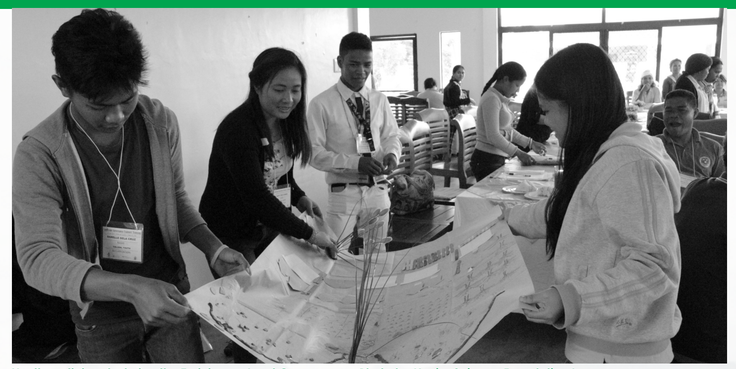
Youth participants during the Training on Land Governance.

age (20 to 39 years old). Economic concerns (i.e. lack of employment, livelihood, and economic opportunities) are said to be the primary push factors (Perez III, 2015).