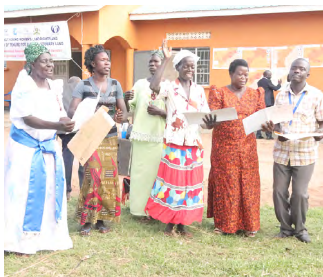
Issuance of certificates in Pader District Uganda