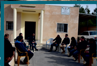
Figure 2: Meeting with representatives from Kisan village, Bethlehem. 3 December 2019.

8 January 2020 Letter of Intent signed between UN-Habitat and LWSC to improve the socio-economic conditions of Palestinian communities through supporting the land settlement process across areas A, B and C through: