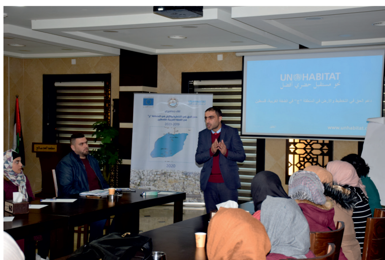
Figure 4: Consultation workshop, Hebron, 6 February 2020.

6 February 2020 Two consultation workshops with the target communities in both Hebron and Bethlehem governorates organized by UN-Habitat and LWSC. Establishing rapport with the communities in general and the women in specific; presenting the project, the land settlement processes, focusing on the importance of the community participation approach in bringing success to this project. 24 participants ages 16-60 attended (16 women), including representatives of the LGUs (three women).