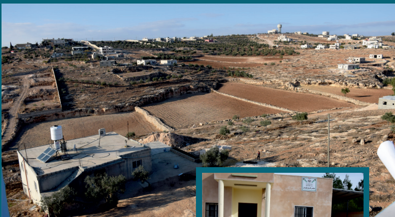
Figure 1: Field visit to Khamlet Al Mayia Community, Hebron. 3 December 2019.

3-11 December 2019 UN-Habitat and LWSC teams visited the targeted communities in Hebron and Bethlehem Governorates: Um Al Daraj, Al Najada, At Tawani, Al- Samu` (Simia), Ar Ramadin, Imnizel, Khamlet Al Mayia, and Al Karmil including Khamlet Saleh and Ma'in in Hebron, and Al Walajah, Wadi Fukin, Kisan, and Minyia in Bethlehem; to introduce the project and main expected deliverables to the Local Government Units (LGUs), and to get a better understanding of the physical and socio-cultural landscapes.