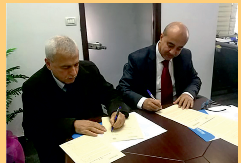
Figure 3: Signing-off on the Letter of Intent between UN-Habitat and LWSC. 8 January 2020.