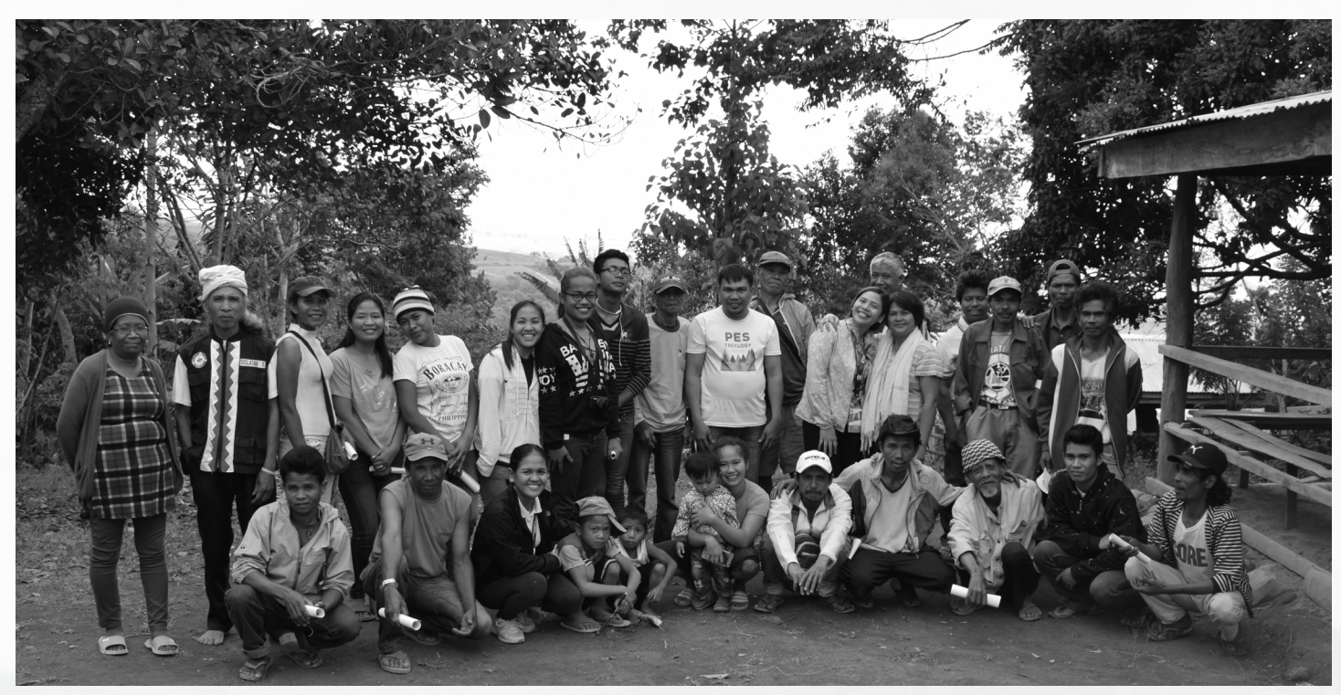
Leaders and some members of the NAMAMAYUK during one of their activities within the GLTN SALaR project.