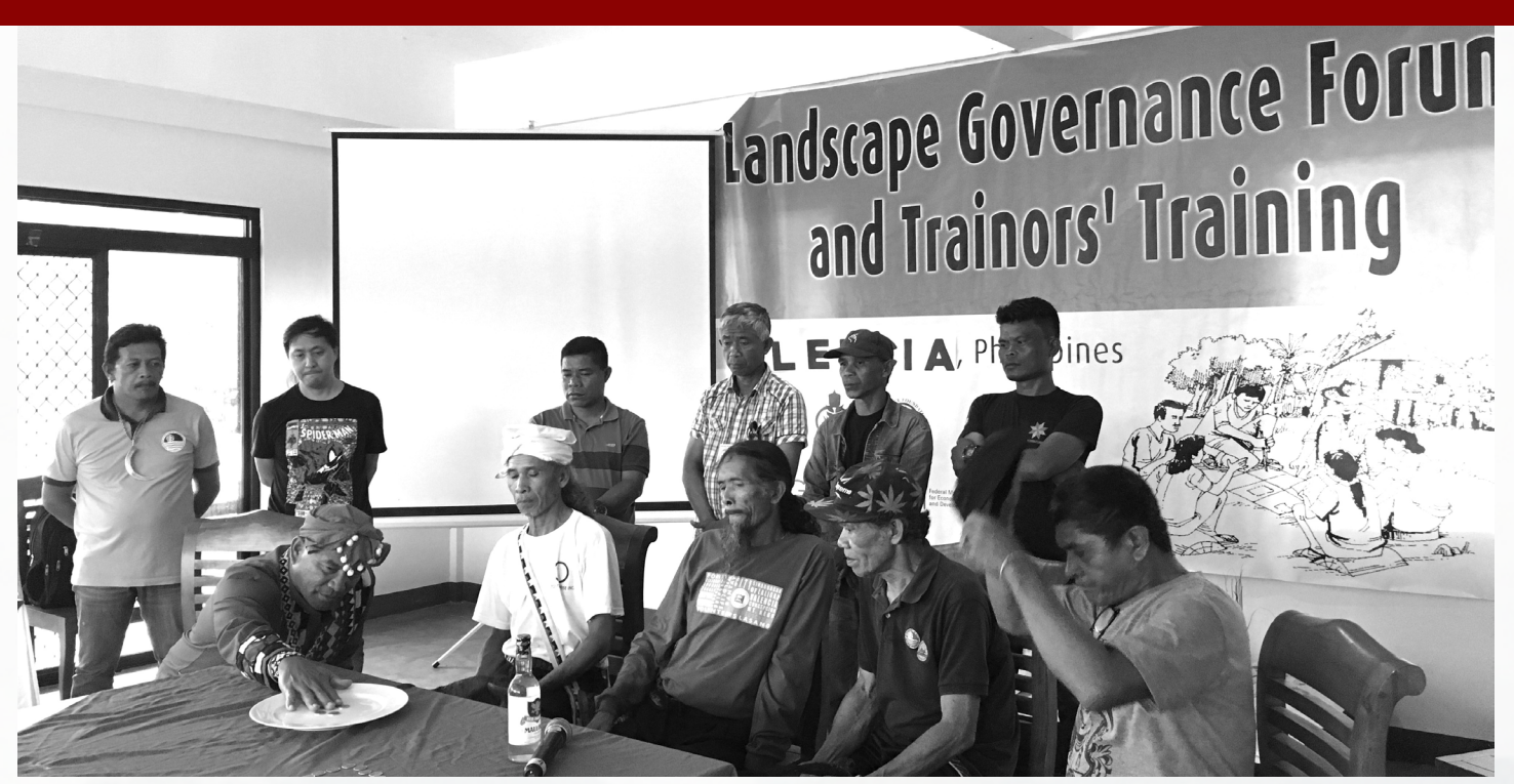
Mt. Kalatungan elders conduct a ritual for the GLTN SALaR project during the Training of Trainors on Landscape Governance held in Valencia, Bukidnon.