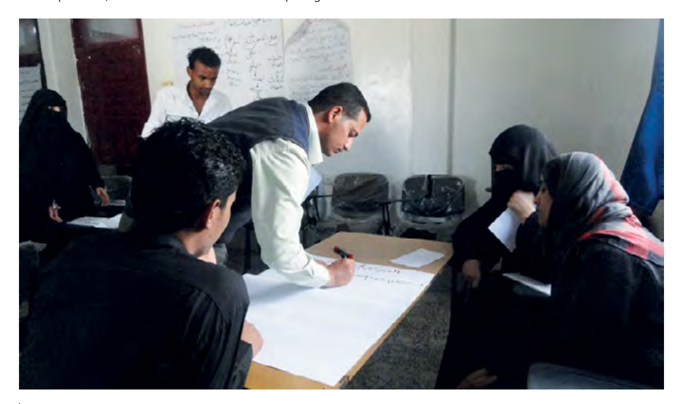
Youth led action research on land, Youth Without Borders Organisation for Development, Yemen.

From a policy and governance perspective, there is a gap in understanding the unifying and participatory mechanisms used by youth to make their voices heard. Land-use planning institutions do not have the capacity to consult effectively with grassroots actors, including youth, which can aid corruption, challenge accountability and silence youth voices. Additionally, the land policies in place are often many and complex. In general, land-related policies may lack coherency and may even conflict within one jurisdiction. Policymakers and the private sector may thus be able to hide behind inconsistencies to justify inaction or corruption.