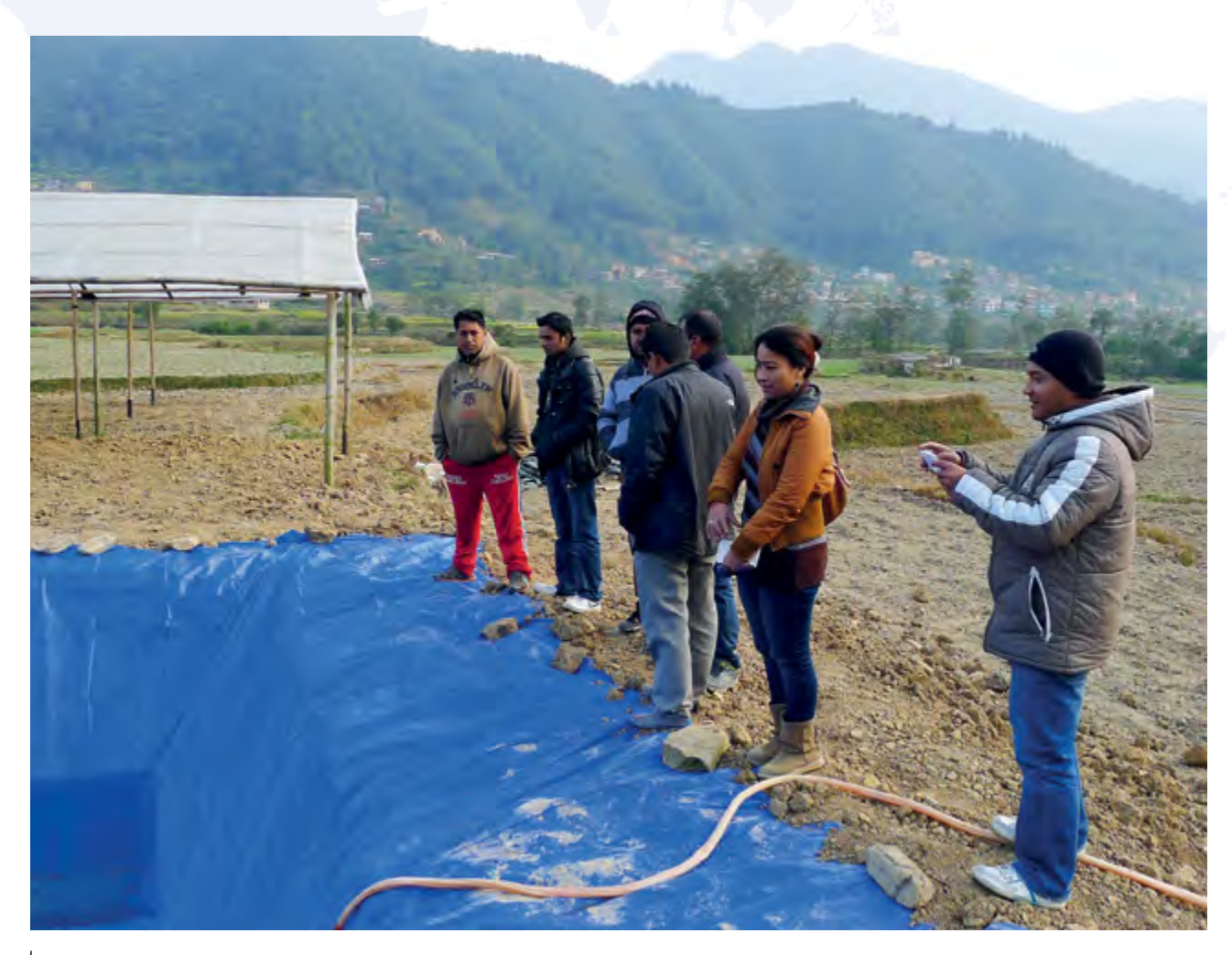
Youth led action research on land, Team for Nature and Wildlife, Nepal.