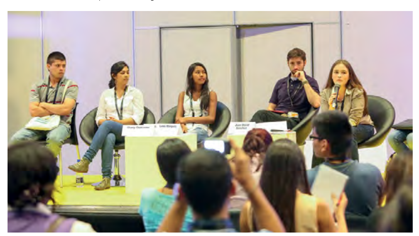
World Urban Forum 7, Sessions 2_Youth and Sustainable Development.

Land policies provide the structure to support the land administration system. To be effective, land policies must be integrated into other governmental policies, including youth and other social policies. They also require strong enforcement and institutional support to ensure implementation at local scales. The main challenge in relation to youth is that land policies generally do not address the needs and rights of youth as a separate category with distinct needs compared with other groups in society. Whilst land policies are present in different forms in nearly all countries, youth policies have been established in only 122 countries worldwide. Only one youth policy - the Statute of Youth, Brazil - is known to mention land and, similarly, and it is estimated that less than 1 per cent of land policies specifically mention youth.