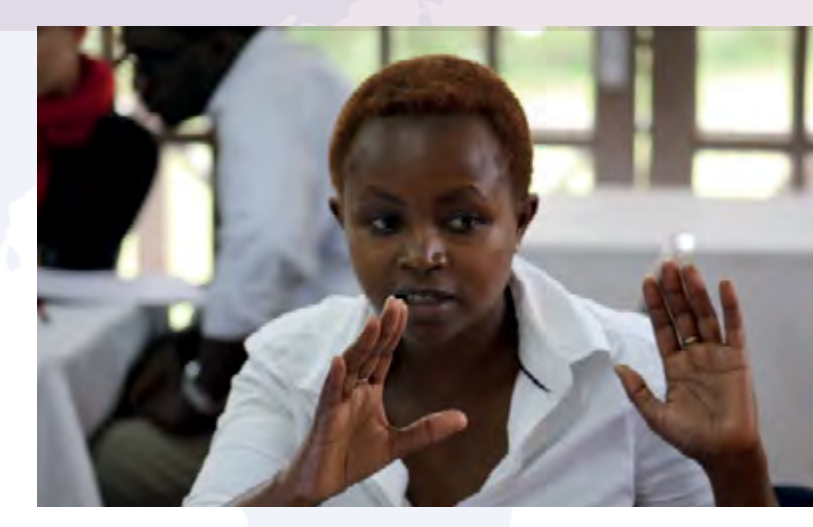
Youth and land workshop Naivasha, Kenya 2014.

In addition to these recommendations, the list needs to be developed further, made more detailed and added to as appropriate. The lessons from the next phase and the implementation at the country level should identify further activities.