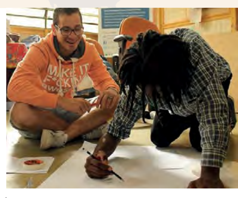
Youth and land project Brazil.

Young people are most often defined by their age. However, this definition may vary from country to country, or the legal age definition does not match that of cultural norms. These aspects need to be considered