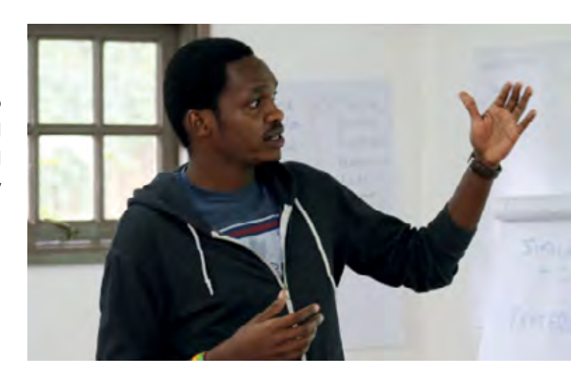
Youth and land workshop Naivasha, Kenya 2014.