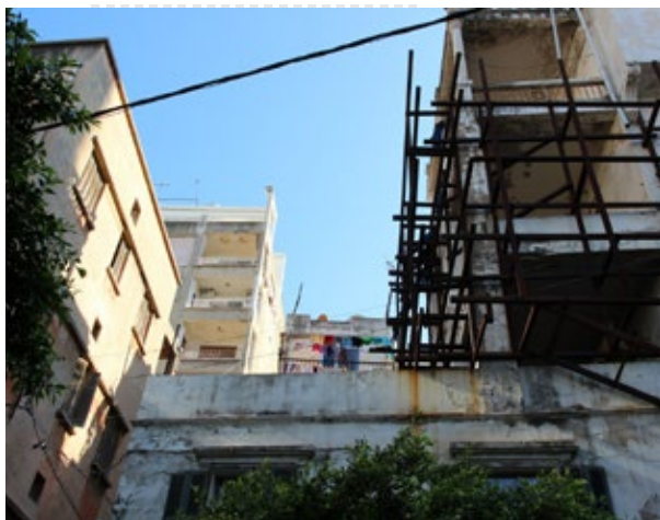
Developing capacities and exploring solutions to land and tenure security challenges in the Arab States.