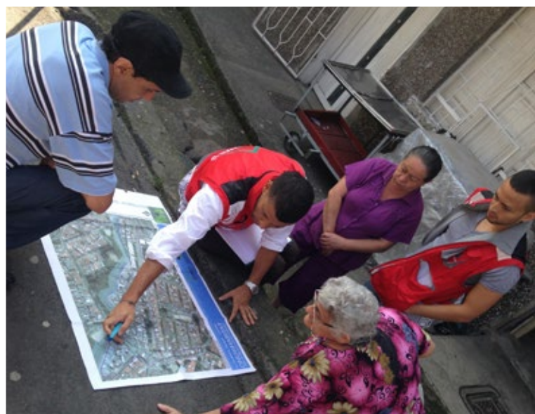
Participatory Community Mapping in Nepal.

The tools and concepts that were promoted have influenced national land policies in several countries.