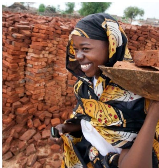
A young woman carries bricks for the construction of a community center in Althoura Shemal in El Fasher, North Darfur.