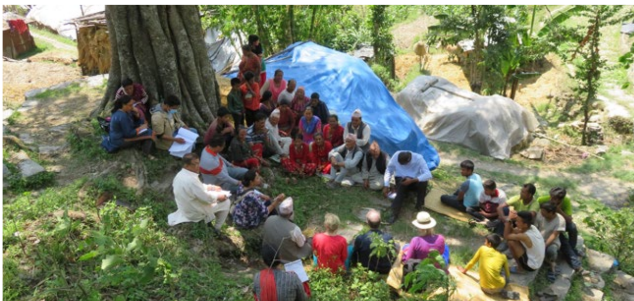
Promoting the use of STDM in Nepal as a flexible, sustainable and holistic tool for enumeration.

global relevance for the challenges of urbanization and rural-urban migration, inequitable access to land, and the displacement of communities by armed conflict or natural disasters. The tools and concepts that were promoted have influenced national land policies in several countries. The adoption of land tenure indicators for various Sustainable Development Goals – and the momentum that this has generated with international donors and partners - has the potential for global impact.