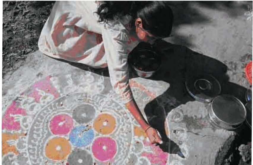
Mandala artist, India.

There is no definitive list of gender responsive land tools. This mechanism proposes to identify those required. The tools needed depend on the problems – and how they may differ for women and men - be it protection against forced eviction or participation in slum grading schemes. Land tools are typically interdisciplinary and include other tools and larger empowerment issues.