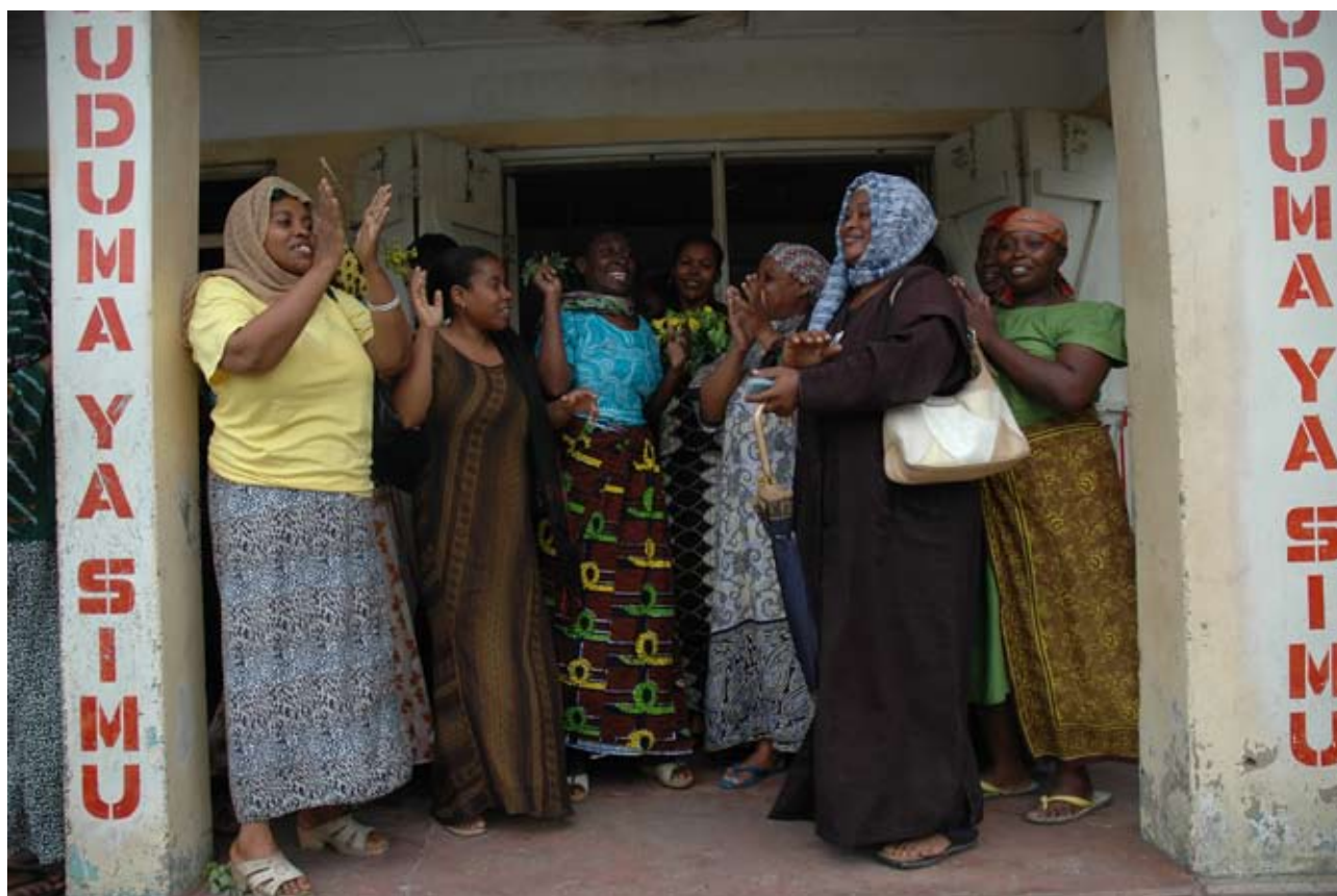
Manzese savings office, Tanzania

The mechanism presented is not a recipe but a guide to be adapted to specific objectives. Some preparations spelt out in the methodologies already underway. Each stage has specific material and resources on the range of fields involved, (land tooling, gender mainstreaming, planning, evaluation), which have to be considered alongside the experience of partners/stakeholders. The mechanism is not a stand-alone document and is to be considered alongside other materials and resources available for partners (see www.glt.net ).