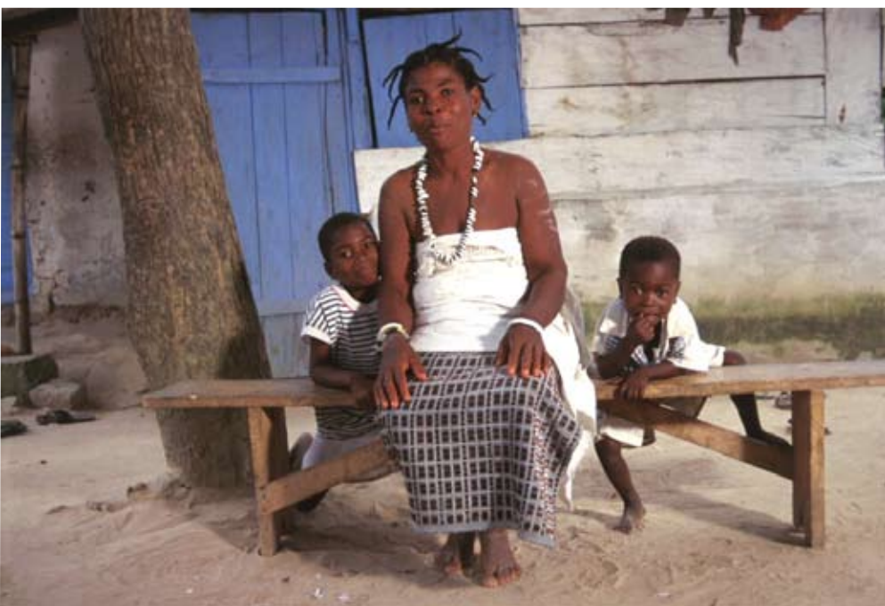
A family in West Africa

There is, at present, limited understanding on how to carry out a substantial inventory of existing large scale land tools. There is also a need to build an inventory of those community tools, appropriate to the GLTN agenda, which could be considered for scaling up. Knowledge regarding tools is fragmented and divided among various sectors. Even within government urban land agencies, different authorities hold related information and there are gaps between the formal and informal processes. The collating of tools used by