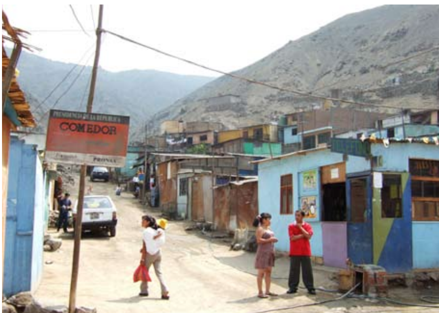
Informal settlement in Lima, Peru

Gender mainstreaming often challenges social, political and cultural mores and will not likely be welcomed with equal enthusiasm in all countries, sectors or organisations. A single model of gender equality for all societies and cultures is unrealistic. Simplistic notions of gender roles and oppression have to yield to complex cross-cultural realities. In practice, a general resistance to gender mainstreaming has been noticed, which may be associated with a Western dominated feminist agenda or seen as promoted by particular vested interests or donor communities. Gender mainstreaming in some contexts can work better through local groups who have credibility or are perceived as being neutral and constructive.