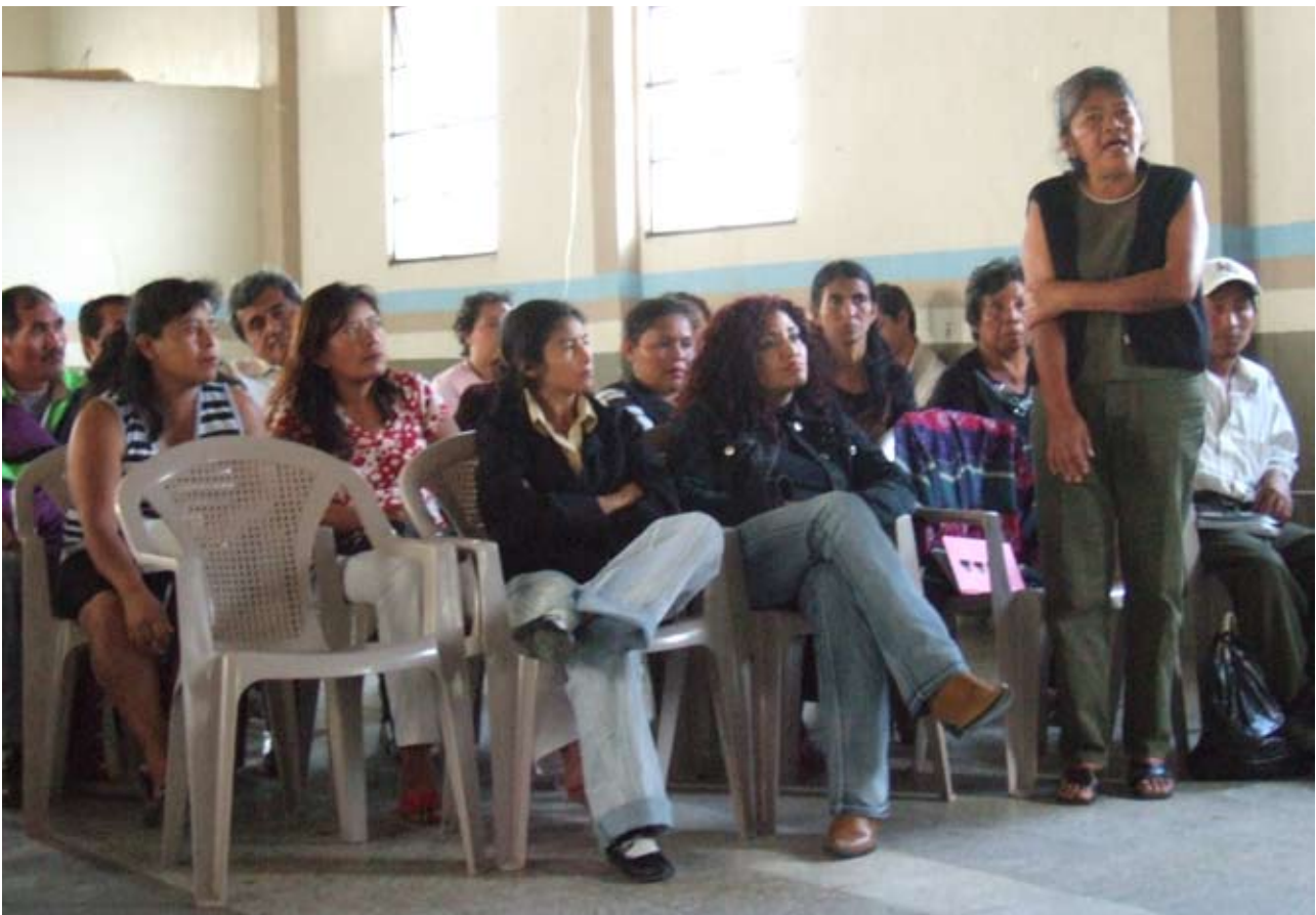
Community meeting in Guatemala City

“Women are vastly under-represented at all levels of government”