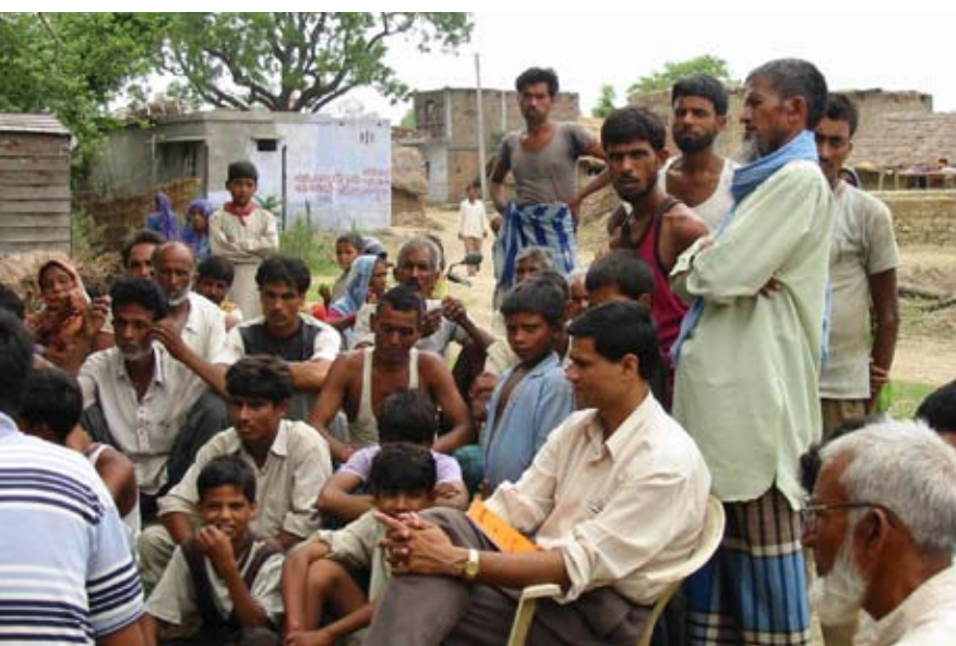
Consultation meeting lacking gender balance, India.

This is better understood through assessment of education, awareness of rights and levels of gender empowerment