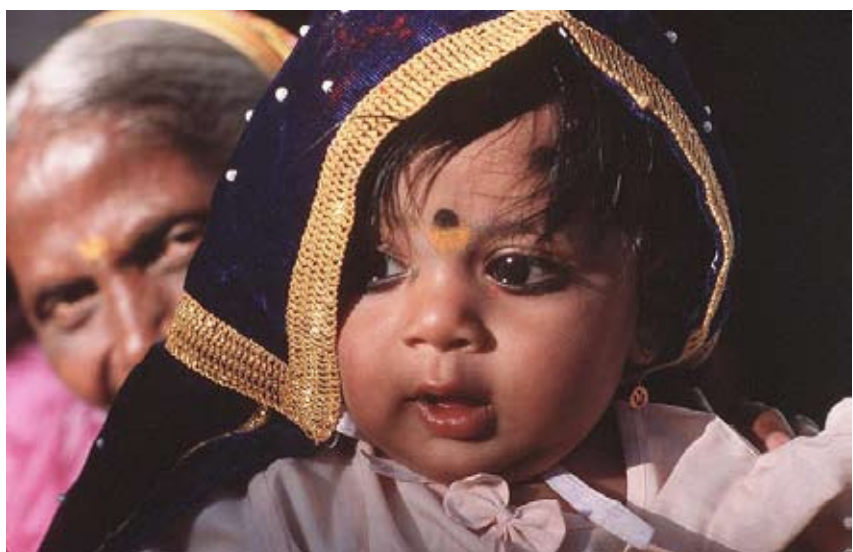
Young girl in India.

Female-headed households, a significant proportion of the poor, can benefit enormously from the security, status and income-earning opportunities which secure rights to even a small plot of land can provide. Women who become singleheads of household are particularly vulnerable. Since women's access to land is often through their husbands or fathers, they may lose such access after widowhood, divorce, desertion or male migration. Secure land rights for female farmers