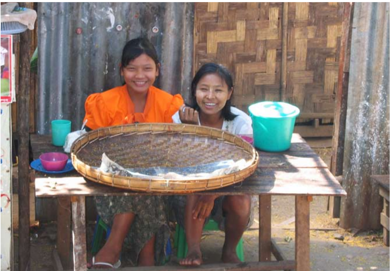
Young street-vendors in Yangon.

This mechanism recognises that there is no single path to effective gender responsive tools. Generic tools must be adapted to different contexts and respond to a diversity of needs, experiences and choices. Therefore, the mechanism provides the structure to guide preparations and set strategies for the tooling process. GLTN, with partners, anticipates that the gender mechanism will serve as a reference guide that prompts critical reflection and innovative approaches.