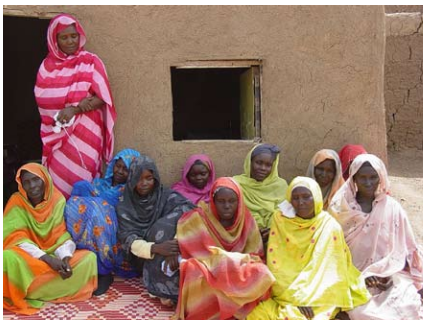
Stakeholder meeting with women in Khartoum.

mechanism is a mutual learning and sharing process rather than a blueprint approach. There is no single path to making tools sufficiently responsive to both women and men. Any generic tools must be adaptive to context and responsive to women's and men's specific needs, experiences and choices. No single partner has the capacity to undertake this hard and difficult tooling process on their own. The mechanism offers a road map for collaboration between stakeholders in gendering tools for land, property and housing rights.