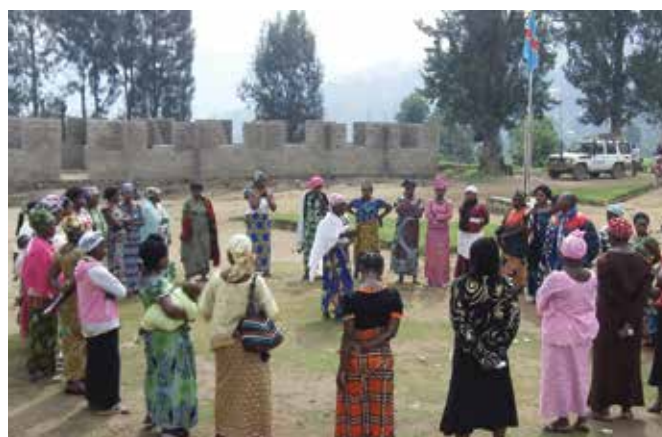
Women groups' training facilities land reforms. North Kivu, DRC.